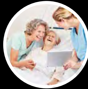
HEALTH SERVICE SKILLS