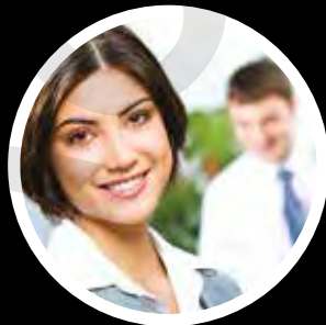
BUSINESS & RETAIL STUDIES