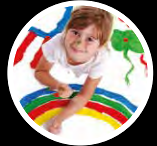
EARLY LEARNING & CARE