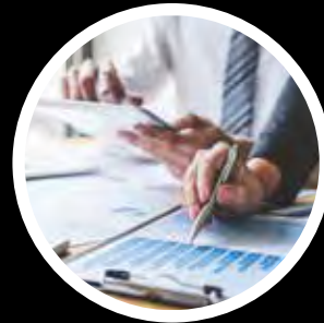
ADVANCED BUSINESS & OFFICE ADMINISTRATION